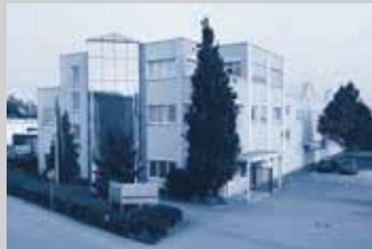
Eckerle Technologies GmbH Otto-Eckerle-Straße 12A 76316 Malsch, Germany