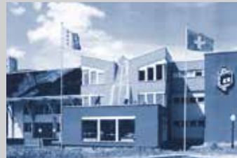
Gotec SA Rue des Casernes, 59 1950 Sion, Switzerland

The data specified only serves to describe the product and must not be understood as warranted characteristics in a legal sense. Subject to technical changes.