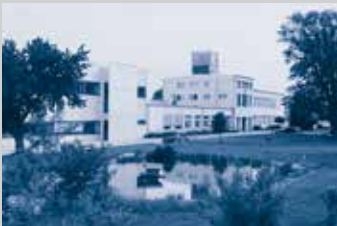
Eckerle Technologies GmbH Hydraulic Division Otto-Eckerle-Straße 6 76316 Malsch, Germany